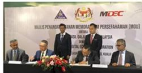
MOU Signing between MDEC & LHDNM