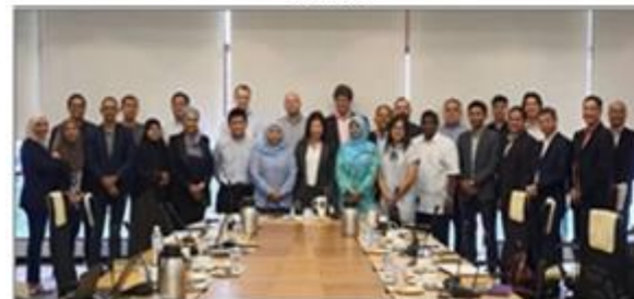
Private Sector Consultation Meeting #1