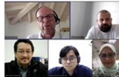
Series of meeting with OpenPeppol