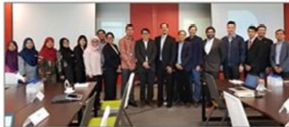
E-invoicing Workshop with IMDA & Malaysia Public Sectors