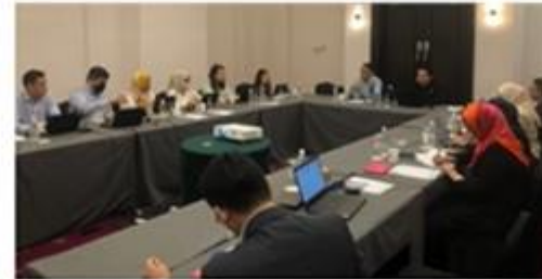
Development of National e-Invoicing Initiative Execution Framework for B2B – Series of discussion